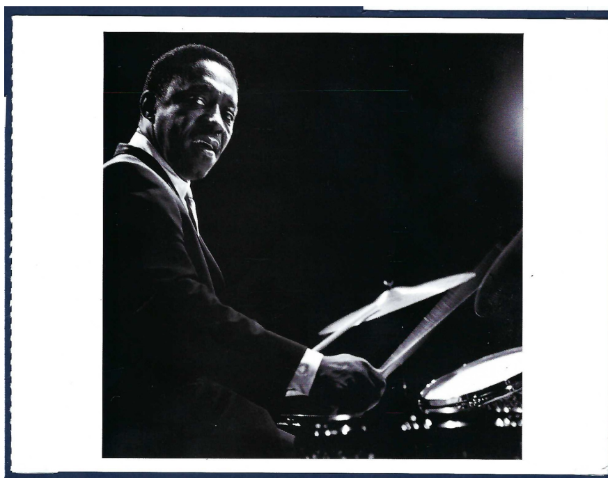
Picture postcard, Lee Tanner photo, 1962. Both postcards from Brian Vincent's postcard collection.